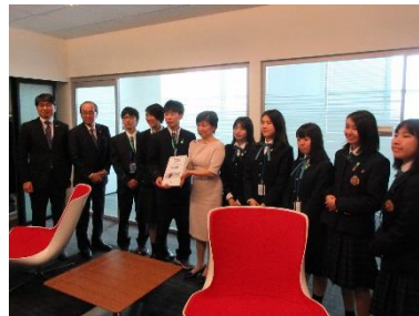
Presenting signatures to the representatives of UN by high school students participating in the petition drive (April 2019, New York)