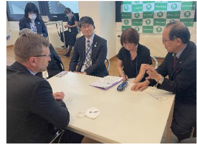
Meeting with national government representatives (June 2022, Vienna)