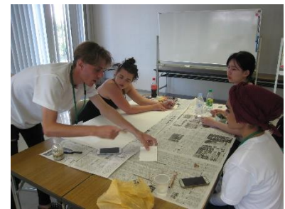
Discussions at the Mayors for Peace Youth Exchange for Peace: Support Program for "HIROSHIMA and PEACE" by youths from member cities (August 2019, Hiroshima)