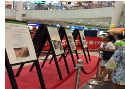
Holding the Mayors for Peace Atomic Bomb Poster Exhibition by a member city (June 2015, Muntinlupa)